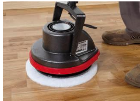
Buffing with a white Pad