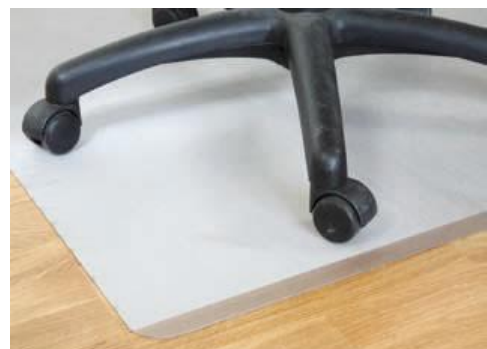
3. Castor Mat