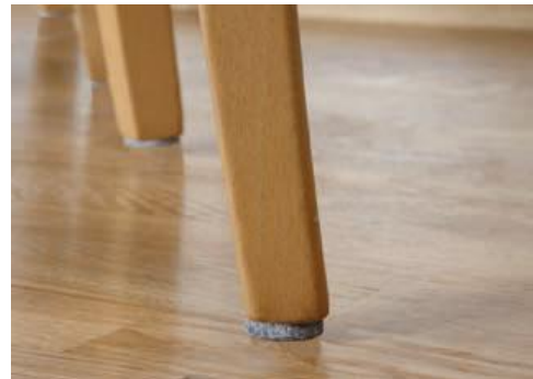
2. Protective Felt Pads